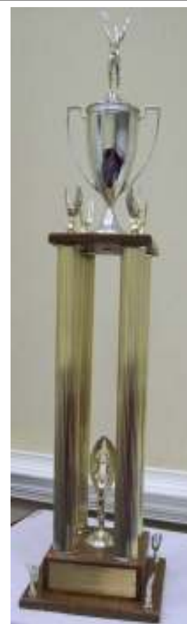
Governor's Trophy Winner 2006-2007 Civitan Year