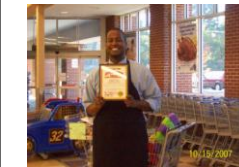
Our store managers like the certificates of thanks.