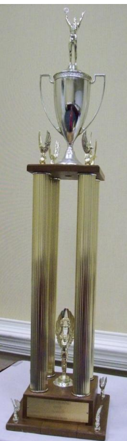
Governor's Trophy Winner 2006-2007 Civitan Year